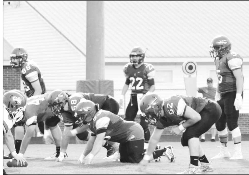
The Towns County defense pitched a shutout in the second half.