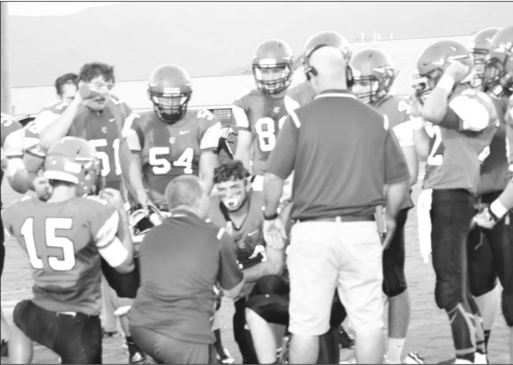
Towns County during a timeout vs George Walton Academy.

The unbeaten Wolverines are coming off a 7-0 victory over crosstown rival Athens Christian. They also own wins over Riverside Military Academy (34-0) and Aquinas (35-14).